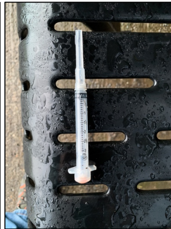
Carefully capped syringe

Notes: The litter totals are above average, especially the plastic scraps from the doggy-poo bag dispensers. The Coho salmon had another major spawning run starting on December 5 th , again after heavy rainfall. Scavenging eagles could often be seen and heard chirping in the trees until the salmon pretty well disappeared at the end of the month. The nice new chain link fence hopefully will help to keep many dogs off the soccer pitch, at least those on the creek-side trail.