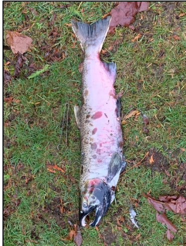
Large dead Coho salmon

TOTALS for December vs AVERAGES (April to December)