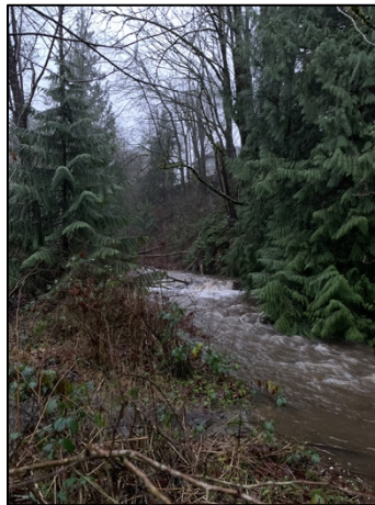
Waterfall after heavy rain