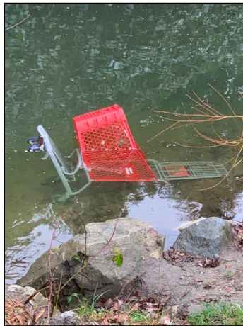
Derelict cart in the pond